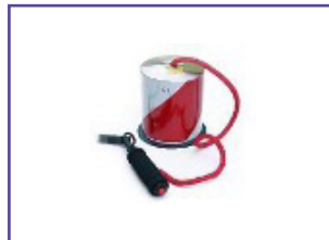
Wind Protected Ground Microphone