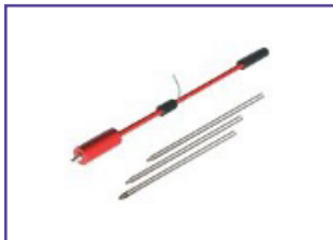
Test rod with extensions