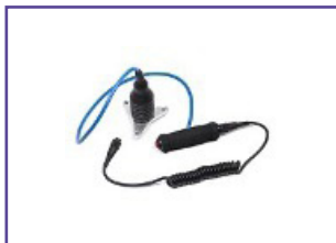
Universal Accelerometer and handle