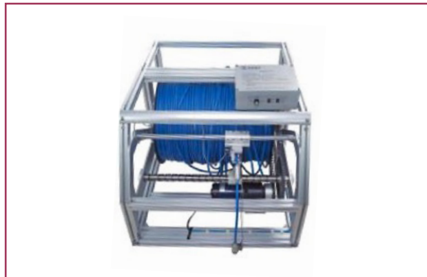
2000m Motorised Umbilical

The X5-HW2 has a 2000-meter (2km) cable and has a vision capability of a 4m diameter pipe.