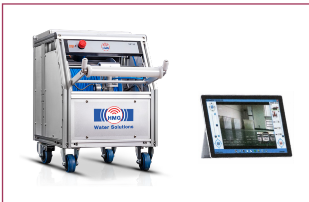
Left - 150m or 300m Motorised Umbilical Right - Control Tablet

Designed for use in pipe diameters from 300mm to 1000mm with an extendable arm. The X5-HT provides unparalleled in-pipe vision using high definition 2.1 or 4.1 megapixel cameras. Incredibly simple to use via a touch screen system either via a tablet / laptop or via the iTouch One inspection and reporting solution.