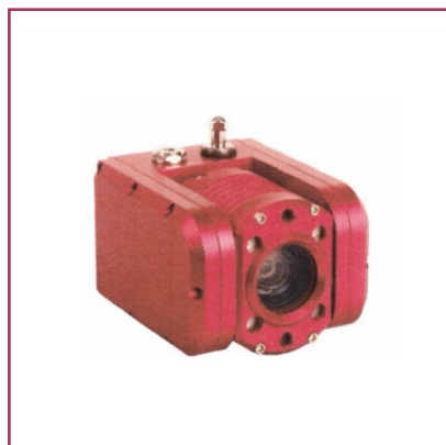
Optional Pan and Tilt Camera