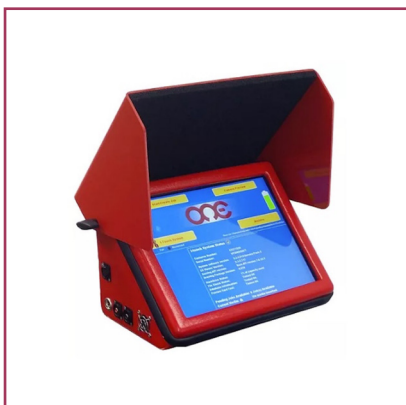
Optional iTouch One Control and Reporting

Link with the iTouch One control and reporting box and the system is a professional WRc approved reporting system that can produce expert reports immediately.