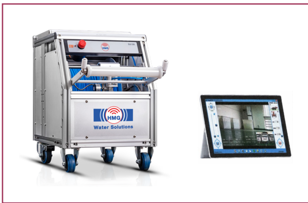
Left - 150m Motorised Umbilical Right - Control Tablet

Designed for use in pipe diameters from 150mm to 300mm (up to 600mm with an extender arm). The X5-HMA provides unparalleled in-pipe vision using high definition 2.1 or 4.1 megapixel cameras. Incredibly simple to use via a touch screen system either via a tablet / laptop or with the iTouch One inspection and reporting solution.